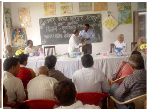
A teacher learning concepts of torque from an experiment