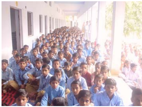
Children in the long school Varanda listening about the Moon