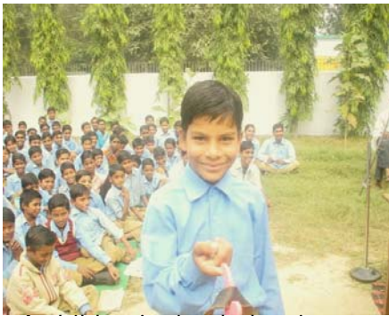
A child enjoying balancing a plastic piece on his finger