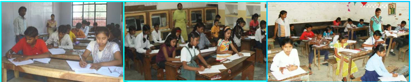
V N Kulkarni Scholarship Test on 24 th April 2011

To select the recipients for the first batch, an examination was held on 24th April 2011 at five different centers near IITK campus. Wide contact programme was initiated by visiting all schools within 2 km from IITK Campus and also by making door-to-door contact in some localities. As a result a total of 698 applications were received. Proper admit cards were prepared with photographs and delivered. With room wise seating arrangements in place, the examination was smoothly conducted at Swami Vivekananda Vidyalaya, Lodhar, G.P.N. Vidyalaya, Barasirohi, Opportunity School, IITK, Vivek Shiksha Sadan, Nankari and Nav Srijan Saraswati Vidya Niketan, Chak Ratanpur. A total of 40 Volunteers of Shiksha Sopan were engaged as Center in-charge and invigilators during the examination. Some IITK employees also came forward and gave their valuable time to conduct this examination.