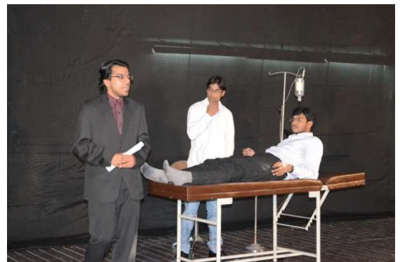
Prof Hardy visiting Ramanujan during his illness